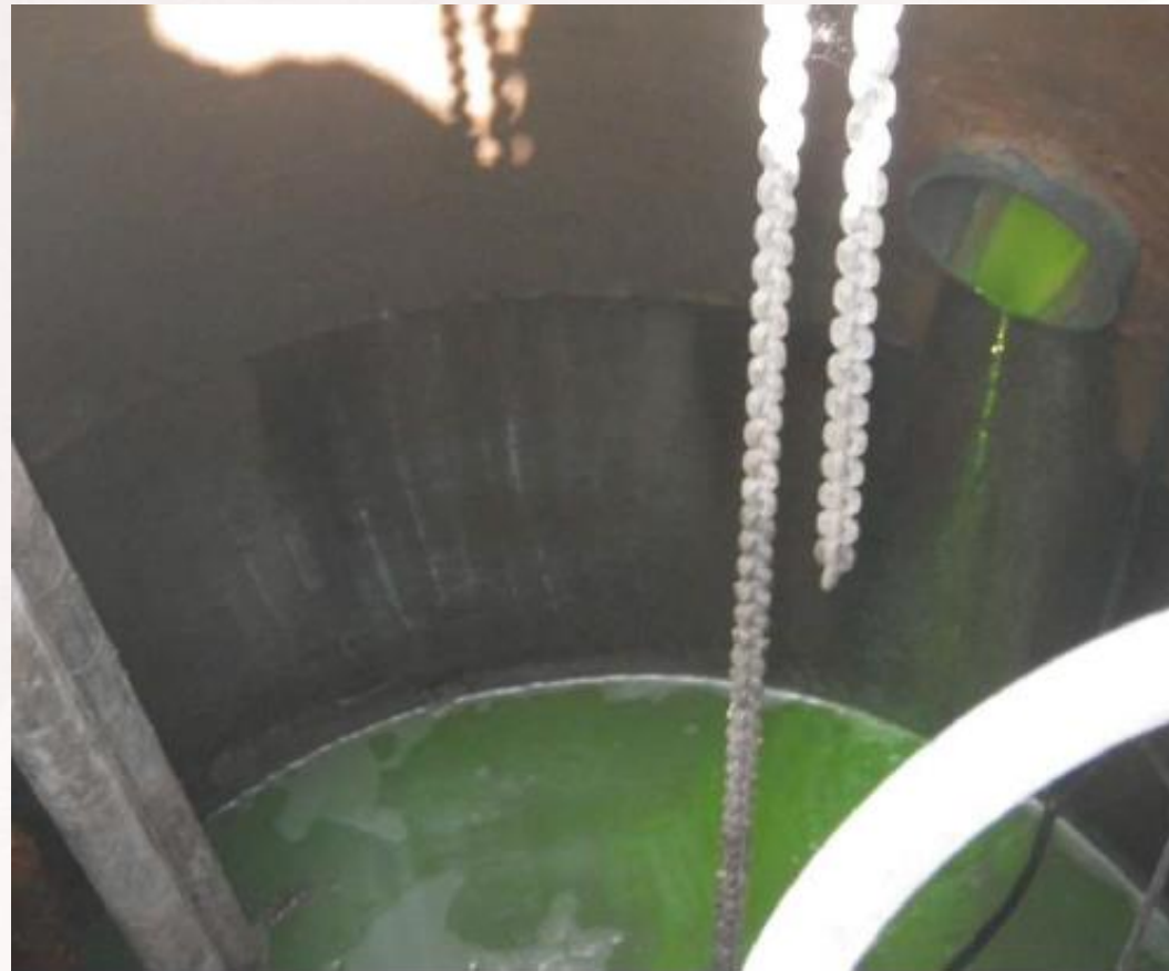
School sewer lift pump station

Dye Testing @ Eastern Shore District High: